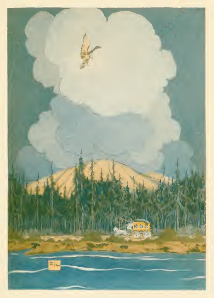
The Stage on the Road to Moosehead Lake